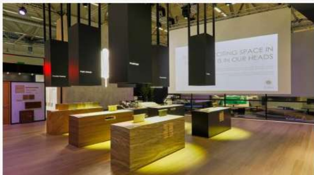
Greenlam Announces the Capacity Expansion of 15.62 Million Laminates Sheets

Greenlam Industries Ltd., the largest producer of Laminates in Asia and a leading provider of decorative surfacing solutions such as HPL, Compacts, Decorative Veneers, Doors and Engineered Wooden Flooring announced a capacity expansion for laminates in Nalagarh, Himachal Pradesh. The expanded capacity is now operational and will be manufacturing an additional 1.6 million laminates sheets per annum.