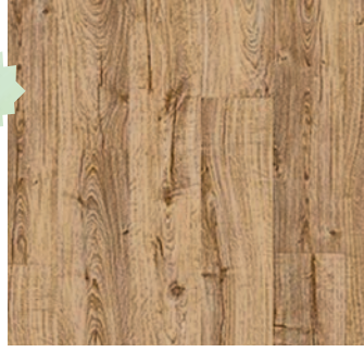
CLOCKWISE FROM TOP Caprifoglio fabrics , price on request; Garden fabric , price on request, both Designers Guild at F&F; Oak plank , ₹350 sqft onwards, Mikasa

CLOCKWISE FROM LEFT Moooi light , price on request, at Lightbox; cushions , ₹1,950, Safomasi; sofa , ₹1,18,500, Iqrup+Ritz; planter , ₹1,100, amazon.in; vase , ₹98,000, Frazer and Haws; bath tub , ₹6,70,000, Etrelux; rug , ₹16,000, Jaipur Rugs; wing chair , ₹23,500, The Purple Turtles; floor lamp , ₹22,800, INV Home.