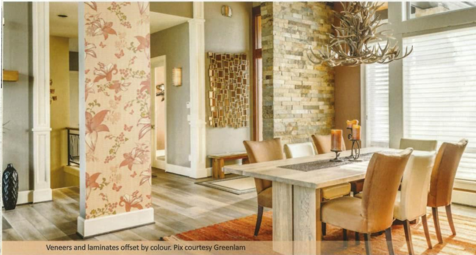
Veneers and laminates offset by colour.