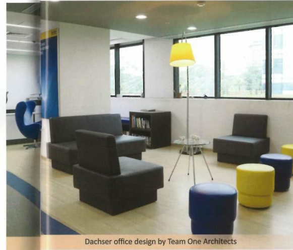
Dachser office design by Team One Architects

As lifestyles change, so do the living spaces. Homes are becoming less formal. The kitchen is fast becoming the epicenter of the home as it includes the dining area, and the (now popular) open layout plan extends seamlessly into the living area. So, the concept of dedicated dining or living rooms will gradually transit to become common hubs of family gatherings. Interiors will see an onslaught of both bold and neutral colours, albeit in unique combinations. Sliding doors and other movable partitions will bring the