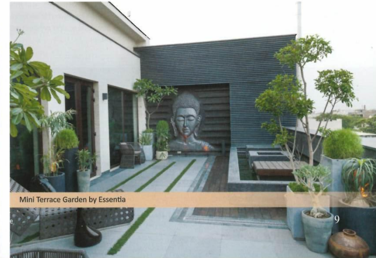
Mini Terrace Garden by Essentia