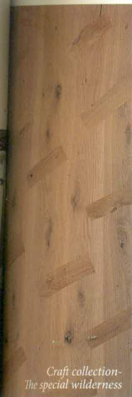
Craft collection- The special wilderness