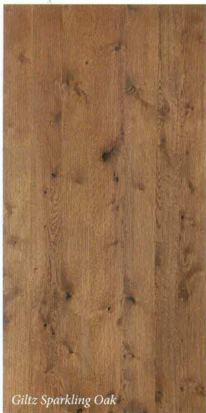
Giltz Sparkling Oak