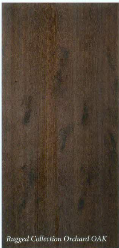
Rugged Collection Orchard OAK