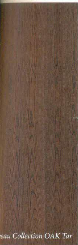
veau Collection OAK Tar