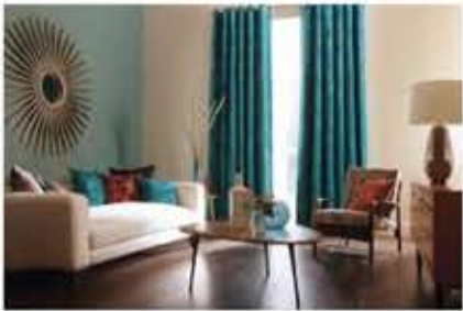
This picture has been used for representation purpose

This summer season is all about trying new trends while spending time at home. Making the most of your cocoon and staying safe in the current times is a priority. For an exciting twist to your everyday home sheltering, here are a few tips of a quick makeover to enjoy, or better yet make the heat a little more bearable.