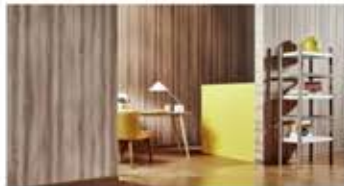
A summer makeover for your home