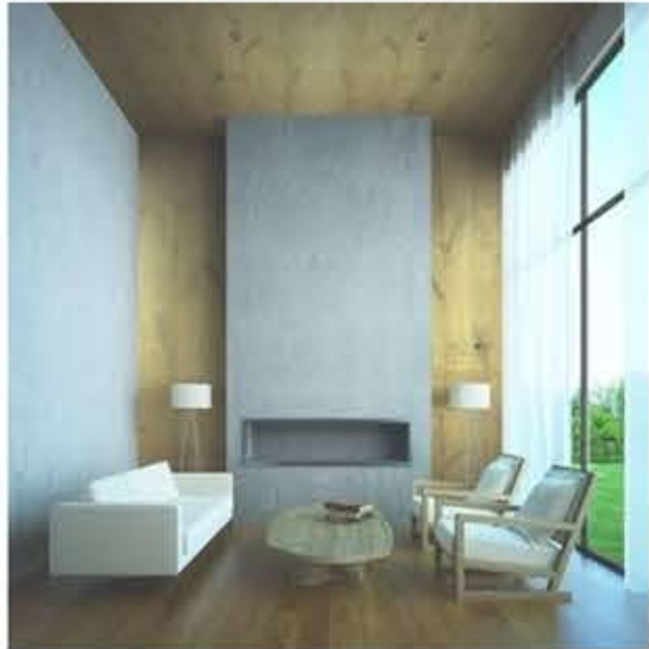
A summer makeover for your home