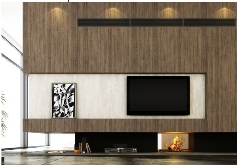
1&2. Easy-to-maintain laminate-clad walls by Merino.