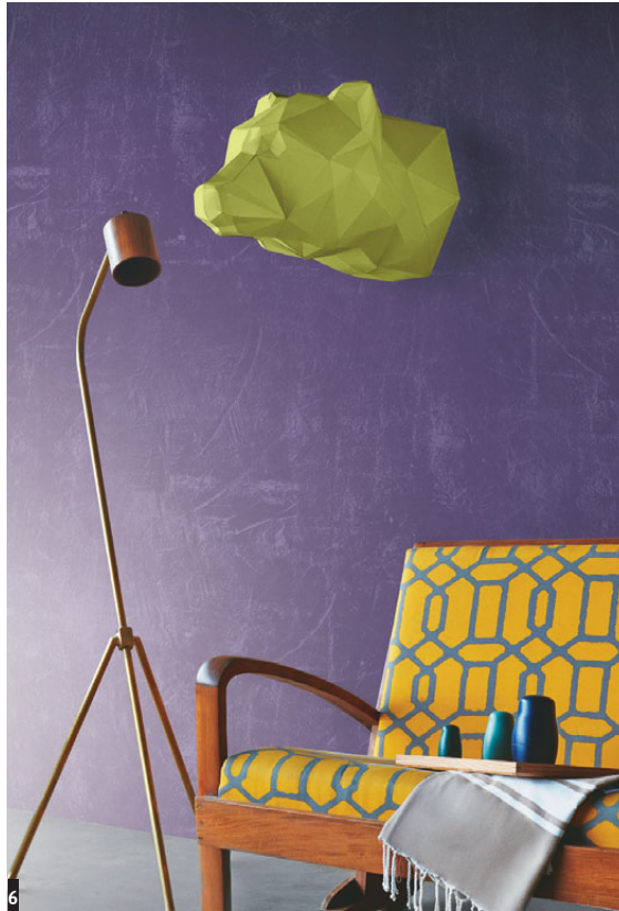
5. Silk Tuff by Century Laminates is ideal for table-top surfaces and kitchen storage units.

With the prime mandate to reduce Greenlam's footprint through clean technologies and to bring innovation in product to reduce consumption, the Green Strategy Group is leading the company's charge as a benchmark in the laminates and decorative surfaces market. "Our products also meet