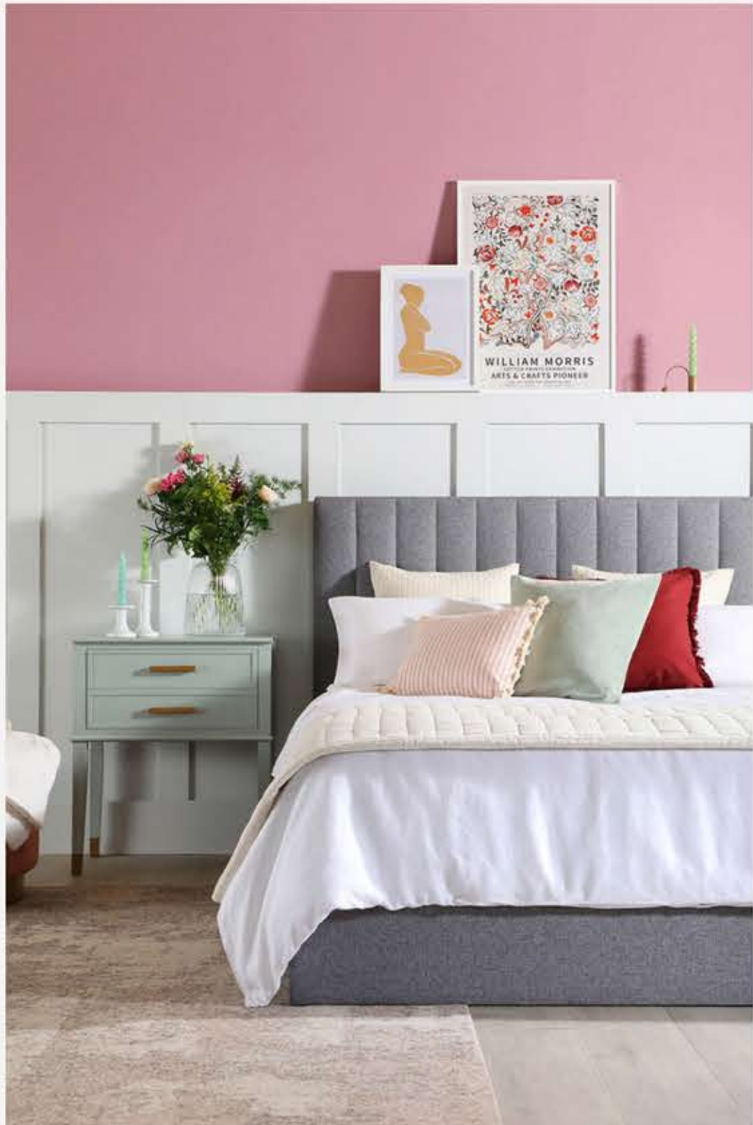
Styling dreamy pastels in a modern home

Channel the carefree nostalgia of a fresh spring day in the meadows with charming pastels like pink, yellow and green. Rebecca Snowden , Interior Style Advisor at Furniture And Choice shares 3 ways to style a modern home with dreamy springtime pastels.