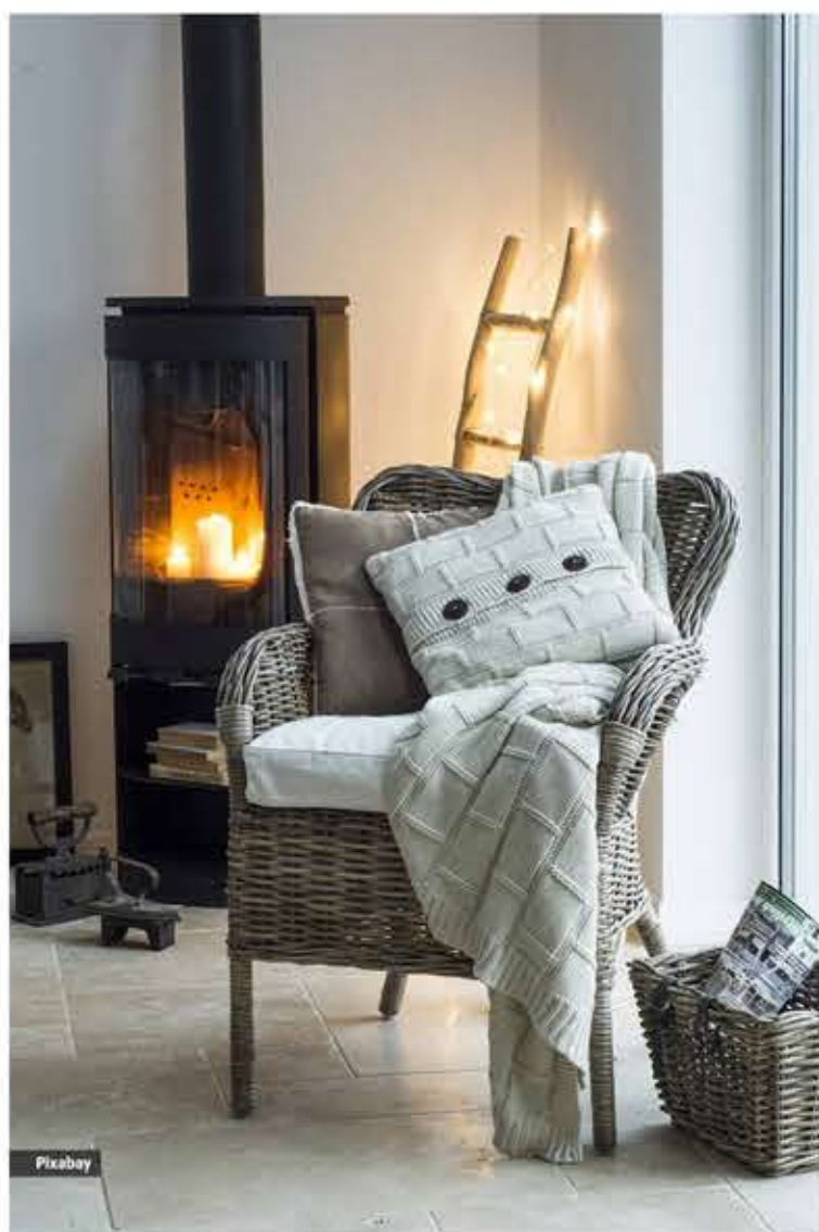
Do you like this winter home decor?

Next, you can make your nook more interesting by "adding some throw blankets, a comfortable armchair, and plush throw pillows."