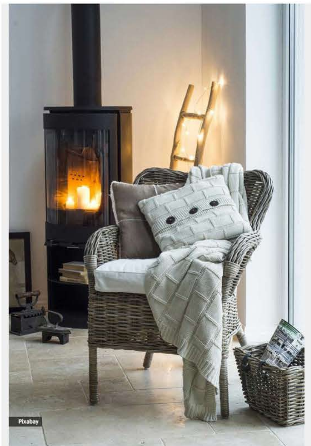
home decor, home decor tips, home decor tips for winter, refurbishing house, winter decor tips for home, simple home decor tips, indian express news

Next, you can make your nook more interesting by "adding some throw blankets, a comfortable armchair, and plush throw pillows."