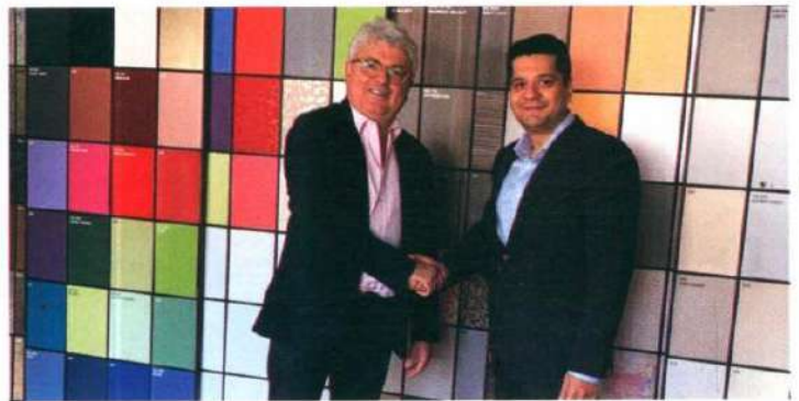
Greenlam acquires Europe based distribution company Decolan SA

The acquisition is expected to be completed in the first quarter of FY'20 and will further strengthen Greenlam's position in the HPL and Compact panels market in Europe.