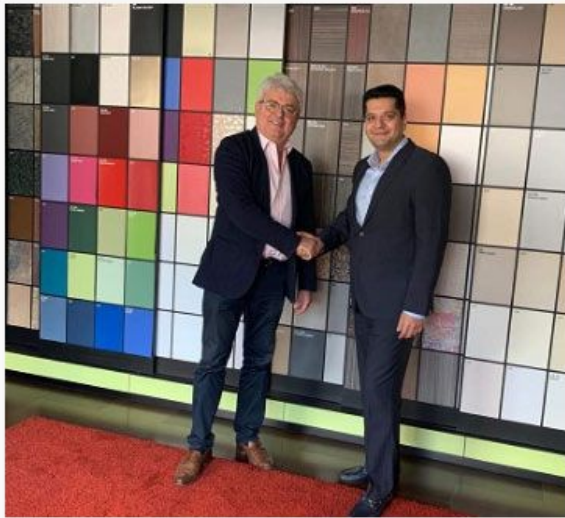
Greenlam Acquires Europe Based Distribution Company Decolan SA

Greenlam Industries Ltd. a leading provider of decorative surfacing solutions such as HPL, Compacts, Decorative Veneers, Doors and Engineered Wooden Flooring announced the acquisition of Europe based leading supplier of decorative surfaces Decolan SA. Decolan is a Europe based distribution company which has been the leading supplier of imported HPL and other decorative surfaces for over 20 years.