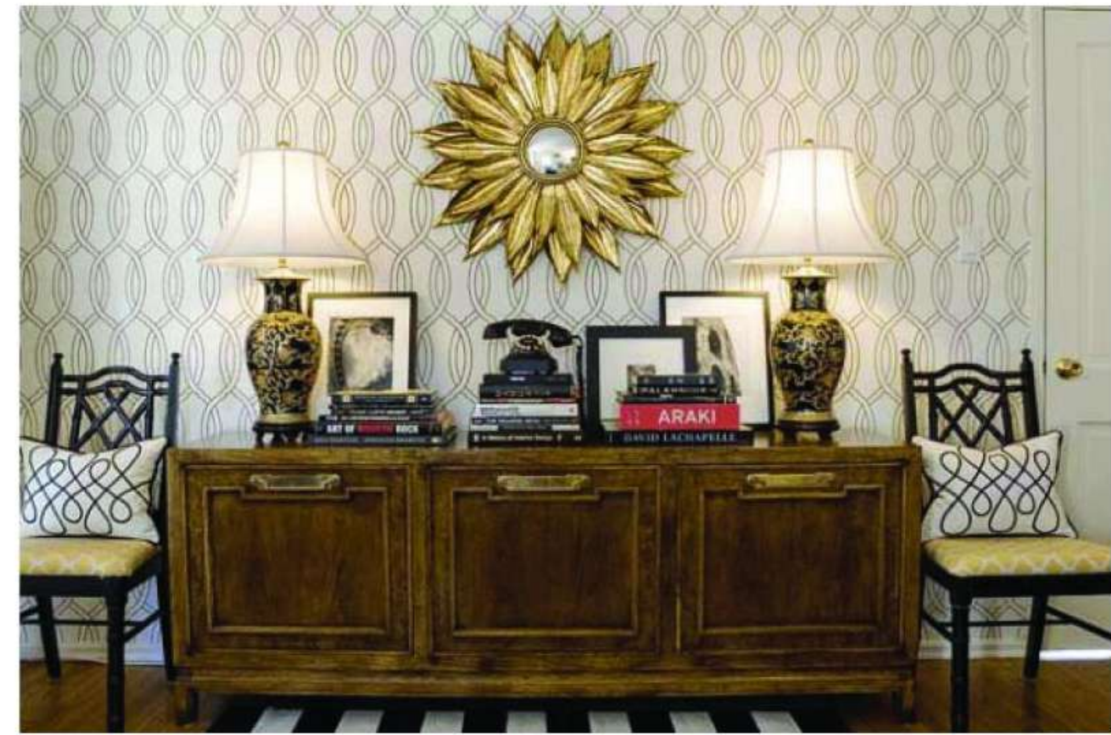
Glitter and glam can be added by including gold decor items