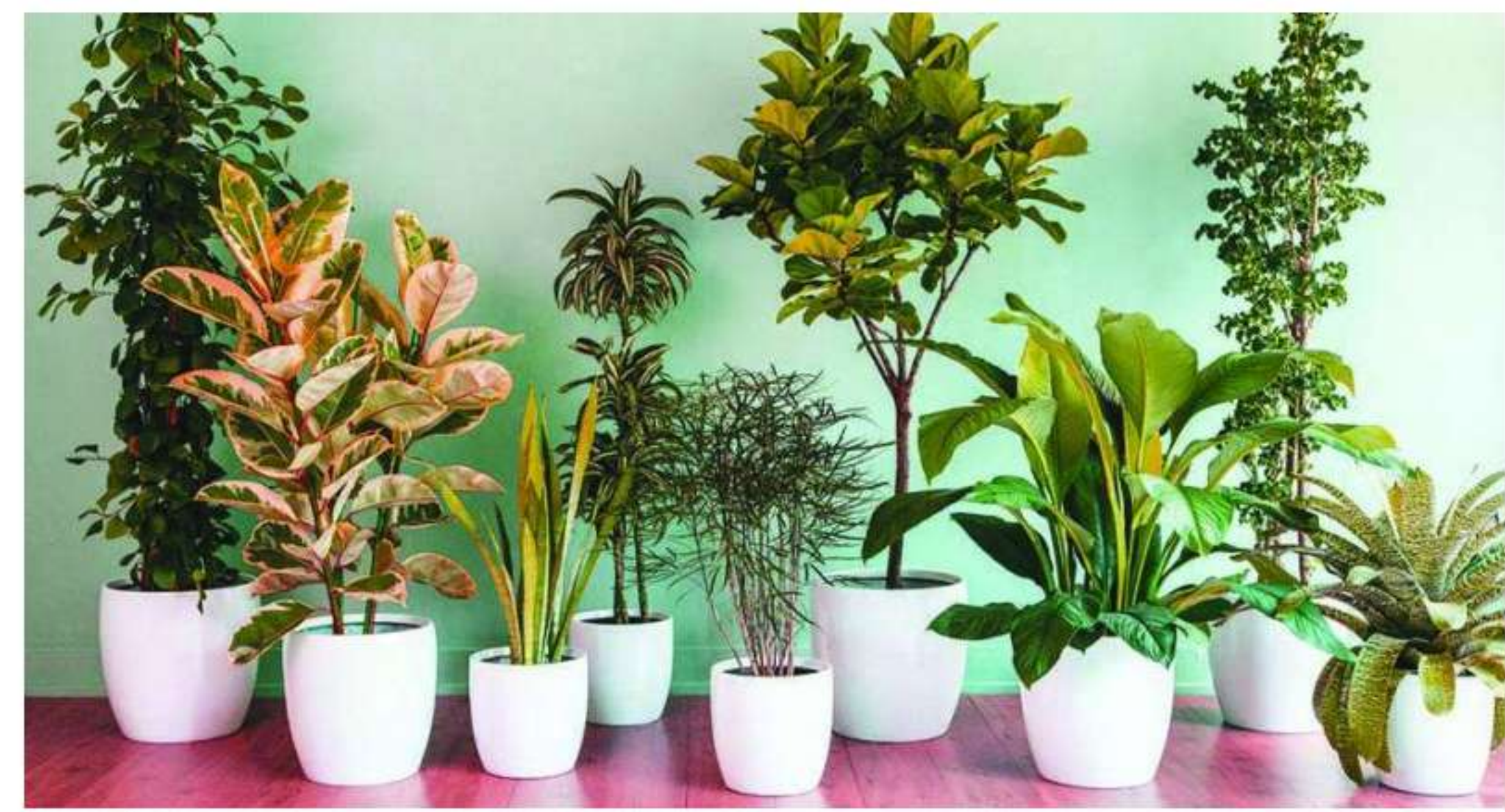
Indoor potted plants are a great investment to your interiors

Just adding an essence of metallic shades to your furniture can highlight the look to your house and give it that much-needed elegance. To give your home a regal yet understated look, add a silk Persian rug in floral prints under your coffee table and have perfect seating for a fun card game with your friends."