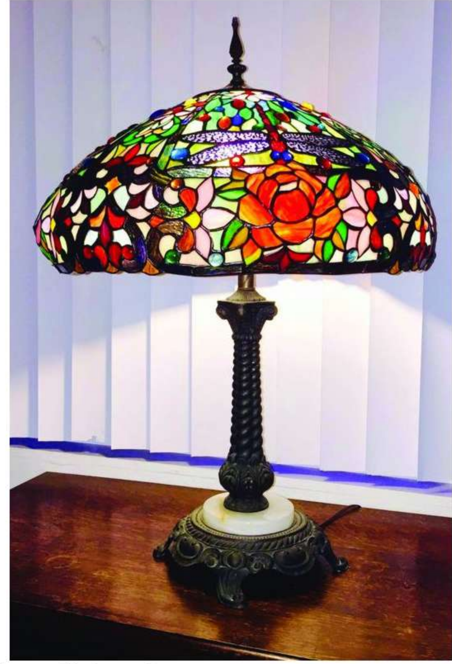
Placing a lamp at a dull corner will brighten up the space in an instant

For starters, make a layered floral artwork for the entrance or even a centerpiece for your coffee table. Use festively packaged gifts laid out on the console which will give it a festive touch and make your house shine bright like a diamond. Indulge in eclectic shades such as deep orange, amber brown, dandelion yellow, and a lot more suburban shades for a revamp. Raseel Gujral Ansal, Founder, Casa Paradox suggests the prominent colours for a festive season are red, green and blue with a hint of gold. She says, "In terms of fabric and prints, one can go with velvet and animal prints. Themes like monochromatic minimalism, industrial chic, tropical vibes, retro and eclectic trends are always a hit. Just add new rugs, floor lamps, and table lamps, chandeliers, wall art or wallpapers, sculptures, artificial flowers, metal fruits to prop up - and you are good to go."