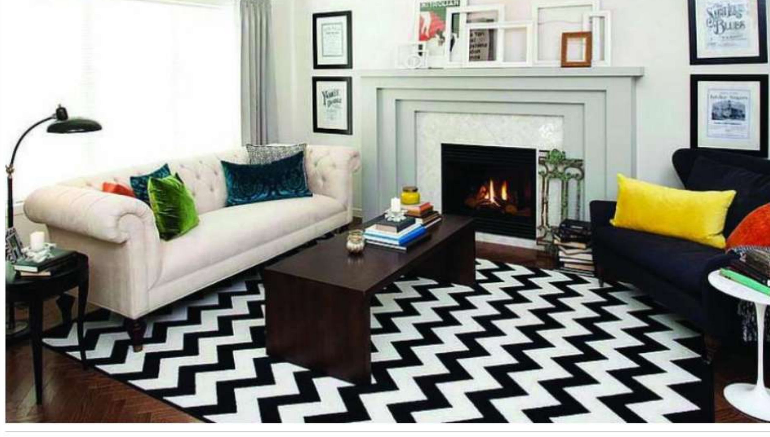
The chevron pattern, which is in vogue now will add that much needed elegance to any room

Small decor items placed aesthetically around the room will instantly make your home festive ready!