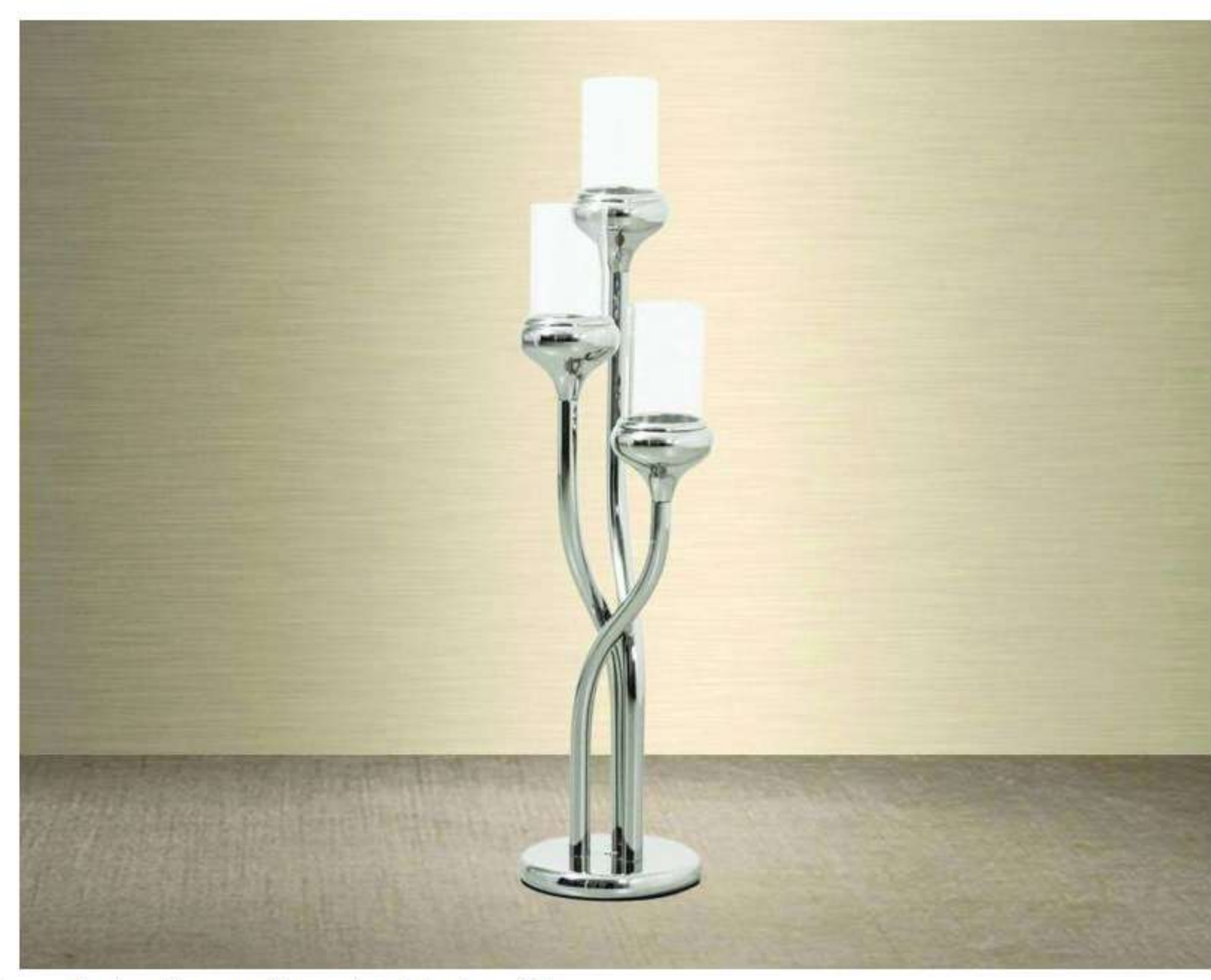
A nice candle stand is a sure fire way to add a dose of charm

Crewel has been trending this festive season, so look for crewel carpets on walls and use this fabric for cushions. You can also place a vase or a paper mache lamp stand on an empty table to light up a dull room. Aromatic candles and essential oils can add a sweet fragrance to your home. String lights are also an elegant way to revamp your room. They create a magical atmosphere. You can drape the lights on an object such as furniture, hang them across a wall or place them in a transparent jar. It will immediately add a festive touch to it."