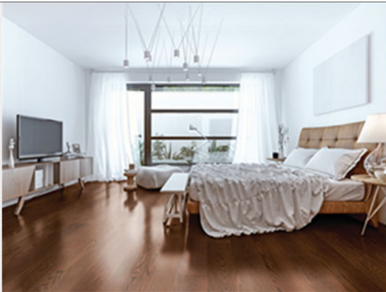
Mikasa Oak Summer

Drawing inspiration from the simplistic serenity that snow brings, one can indulge in an all-white interior theme for their space with quirky accessories which is a win-win for this season. Decorate your room with Greenlam's Frosty White Laminates in matte finish and accentuate the look with white linen curtains and eccentric chandeliers. While they add drama to a space, all-white décor imbues perfect harmony in one's home. If you like contrasting interiors, add inklings of black decorations like a beautiful statement showpiece or a pretty little desk clock in bright tangerine.